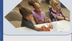
Vacation Bible School August 2-6, 2021