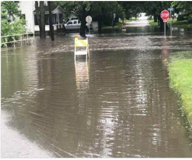
These spots of rain-soaked parts of Farmer City, the corner of Plum and High streets, in Farmer City, Illinois, following about 7 inches of rain that passed the Illinois county city street Thursday, one of the largest towns in the area.